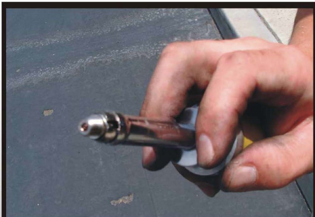
Don't burn your fingers.

First take the glow plug out and look at the coil. The coil should not look burnt or bent up. Next take the glow plug and put into your glow heater as shown below. You should see the coil glow bright orange. Be careful not to touch the coil. It may burn your finger.