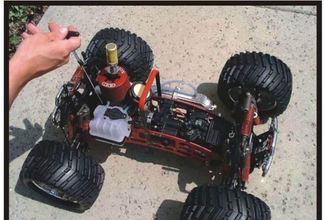
Wrong way to pull

Make sure you pull the cord out to the side and not up. Pulling the cord up like shown in the picture on the right will cause the cord to snap.