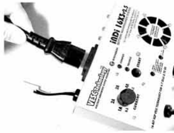
110-120V AC CORD INPUT CONNECTION

Do not leave the battery and charger unattended while in use. Do not operate the charger near water. It is the users responsibility to follow battery mfg. suggested charging rate. Users must also closely monitor the pack temperature during fast charging. Overcharging may occur if the 16X3 malfunction or, when user does not follow battery mfg. recommended charge rate. Never connect the charger to an automobile while its engine is running. This charger is not intended for use by unsupervised children. This charger is designed for R/C car high power Ni-Cd battery only. When charging, also monitor the temperature of the charger. If the unit becomes too hot, disconnect the unit.