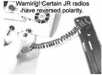
THIS PLUG IS FOR TX/RX SLOW CHARGE

Warning! Certain JR radios have reversed polarity.