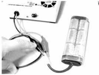
CONNECT TO A 4-7 CELL PACK (sub-c size only)