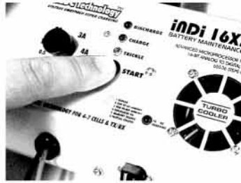
PRESS START TO FAST CHARGE (REPEAK)