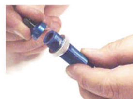
STEP17, Close top cap by hand