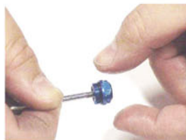
STEP7, Be careful not to damage the o-rings