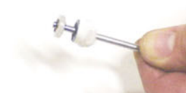
STEP10, Sealing Tape properly wrapped