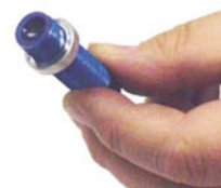
STEP16, Fill up and install blue bladder