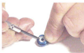
STEP6, reinstall the c-clip now