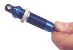
STEP18, Shock rebuild is completed