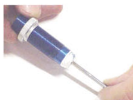
STEP11, Hand tighten the bottom cap