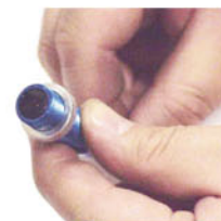
STEP15, Remove any air bubble