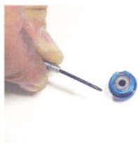
STEP2, Remove c-clip using a small tool