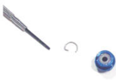
STEP3, c-clip removed as shown