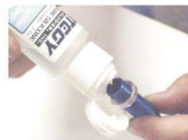
STEP14, Fill shock with 100% silicone oil