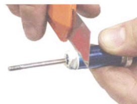
STEP12, remove any excess Teflon tape