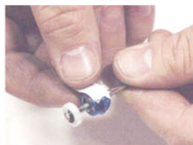
STEP9, wrap tape counter-clockwise as shown