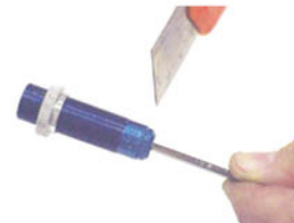
STEP13, Excess tape removed