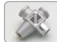
M1042.044 Carburator body, 1pc