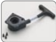
M1042.018 Pull start unit, set