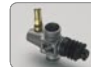
M1043.019 Carburator OMEGA, set