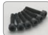
M1046.013 Head screws, 6pcs