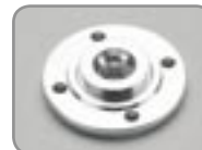
M1043.011 Burn room OMEGA, 1pc