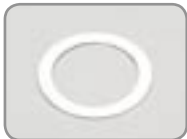
M1042.036 Cylinder head gasket SX-21, 1pc