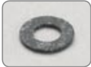
M1046.029 Washer, 1pc