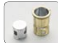
M1043.010 Cylinder & piston OME- GA 8P, set