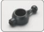
M1040.056 Throttle arm slide carburator, 1pc