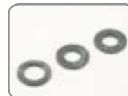
M1046.024 Washer, 3pcs