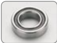
M1044.022 Rear ball bearing 13mm, 1pc