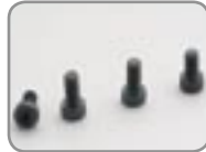
M1040.015 Pull start cover screws, 4pcs