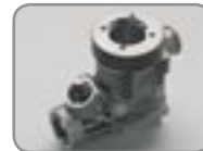
M1042.040 Crankcase, 1pc