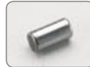
M1042.023 Starting pin, 1pc