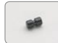
M1042.047 Pull start string seat, 1pc