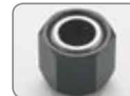
M1042.048 One way bearing & seat, set