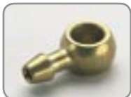
M1046.025 Fuel supply nipple, 1pc