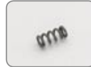
M1040.039 Spring, 1pc