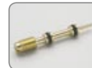
M1043.015 Throttle needle, 1pc