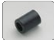
M1042.029 Buffer head, 1pc