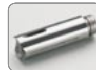
M1043.014 Throttle drum OMEGA, 1pc