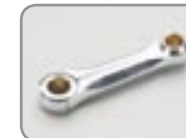
M1043.008 Conrod OMEGA, 1pc