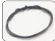
M1042.020 Pull start string, 1pc