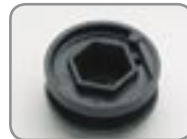
M1042.039 Winding plate, 1pc