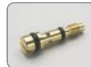
M1043.013 Supply needle valve, 1pc