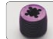
M1043.050 Cylinder head PURPLE, 1pc