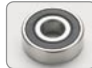
M1042.033 Front ball bearing, 1pc