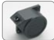
M1042.038 Pull start cover, 1pc