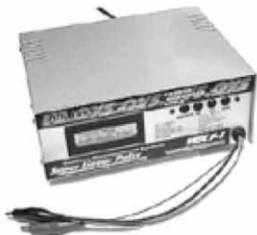
2-lines 16 characters dot-matrix LCD display