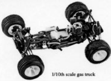
1/10th scale gas truck

MIP has produced the highest quality side headers, and pipes available. High performance Side Pipe kits include a header, a side pipe, and hardware.