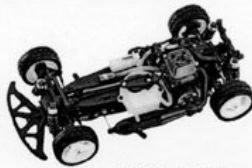
1/10th scale touring car