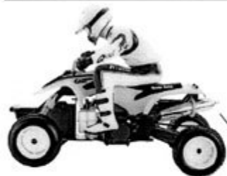
MIP Stinger kit on Kyosho Quad Rider.

MIP has produced the highest quality rear exhaust system available. The MIP Stinger kit for the Kyosho Quad Rider greatly increases power and overall performance.