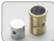
M1042.004 Cylinder & piston SX-21