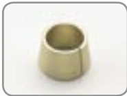
M1040.003 Drive washer cone, 1pc