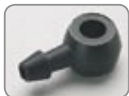
M1040.026 Fuel supply nipple, 1pc