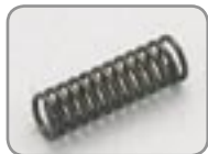
M1042.024 Pressure spring, 1pc