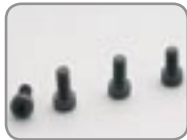
M1040.015 Pull start cover screws, 4pcs