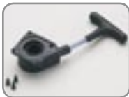
M1042.018 Pull start unit, set