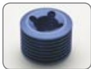
M1042.035 Cylinder head BLUE