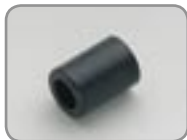
M1042.029 Buffer head, 1pc