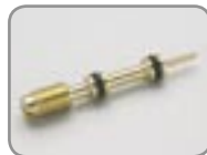
M1043.015 Throttle needle, 1pc