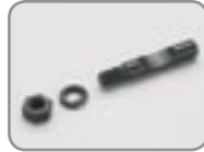
M1042.007 Carburator setting pin, set