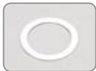
M1042.036 Cylinder head gasket SX-21, 1pc