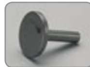
M1042.022 Pull start axle, 1pc