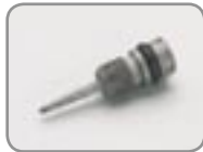
M1040.014 Main needle, 1pc