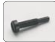
M1040.025 Throttle stop adjuster screw, 1pc