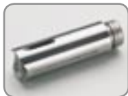
M1042.046 Throttle drum