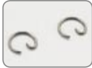
M1042.006 Piston pin clips, 2pcs