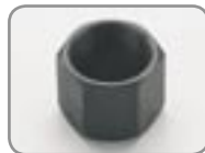
M1042.030 One way bearing seat, 1pc