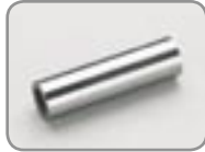
M1042.005 Piston pin SX-21, 1pc