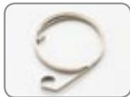
M1042.019 Recoil spring, 1pc