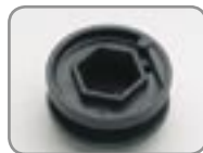
M1042.039 Winding plate, 1pc