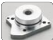
M1042.042 Pull start crankcase cover, 1pc