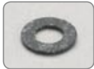
M1046.029 Washer, 1pc