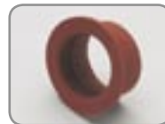
M1042.032 Manifold rubber, 1pc