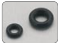
M1042.016 Supply needle O-ring, set