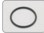
M1042.008 Rear cover O-ring, 1pc