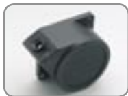
M1042.038 Pull start cover, 1pc