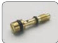
M1042.015 Low end needle, 1pc