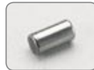
M1042.023 Starting pin, 1pc