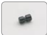
M1042.047 Pull start string seat, 1pc