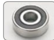
M1042.033 Front ball bearing, 1pc