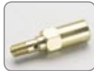
M1040.016 Main needle seat, 1pc