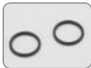
M1042.037 Carburator O-ring, 2pcs