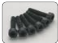
M1042.045 Head screws, 6pcs