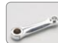
M1042.001 Conrod, 1pc