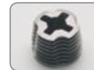
M1042.050 Cylinder head