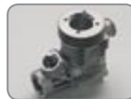
M1042.040 Crankcase, 1pc