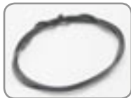
M1042.020 Pull start string, 1pc