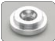
M1042.025 Burn room