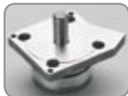
M1042.027 Pull start crankcase cover, set