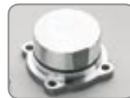
M1042.041 Crankcase cover, 1pc