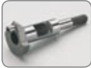
M1042.002 Crankshaft 12mm, 1pc