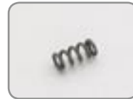
M1040.039 Spring, 1pc