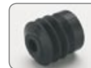
M1042.049 Throttle drum cover, 1pc