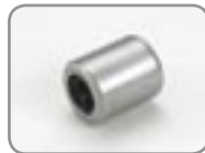
M1042.021 One way bearing, 1pc