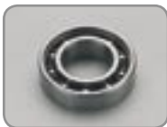
M1044.034 Rear ball bearing 12mm, 1pc