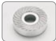
M1042.043 Drive washer, 1pc