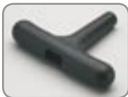
M1042.026 Pull start handle, 1pc