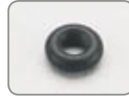
M1042.011 Main needle O-ring, 1pc