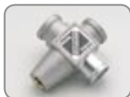
M1042.044 Carburator body, 1pc