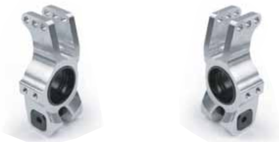
#35 3365 - LEFT