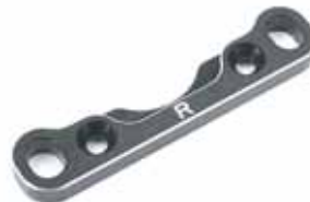
#35 3310 Alu Rear Lower Susp. Holder - Front - 7075 T6 (5mm)