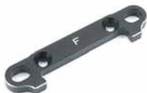
#35 2310 Alu Front Lower Susp. Holder - Front - 7075 T6 (5mm)