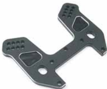
#35 2090 Alu Front Shock Tower - CNC Machined 7075 T6 (4mm)