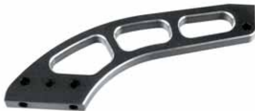
#35 2086 Alu Front Brace 7075 T6 (5mm)