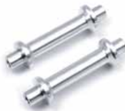
#35 3550 Alu Rear Wing Mount Brace (2)