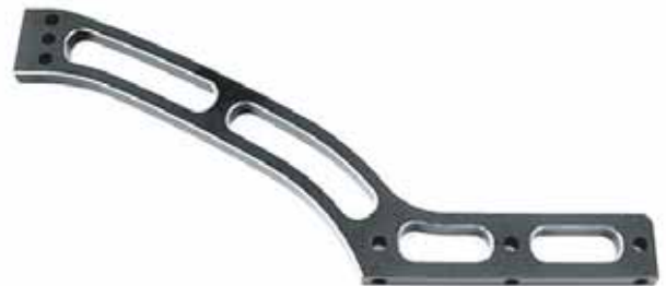
#35 3085 Alu Rear Brace 7075 T6 (5mm)