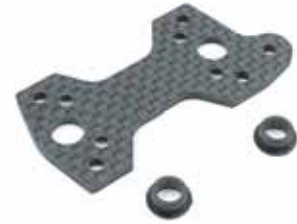
#35 4050 Graphite Center Diff Mounting Plate