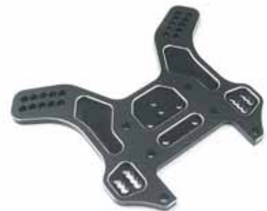
#35 3090 Alu Rear Shock Tower - CNC Machined 7075 T6 (4mm)