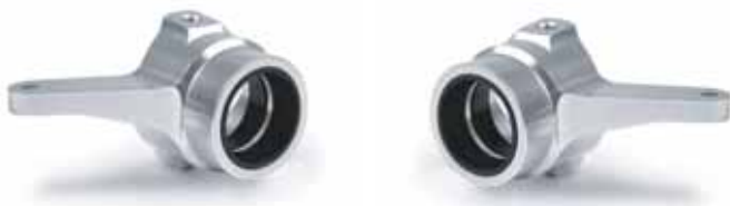
#35 2265 - LEFT