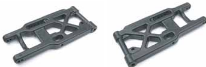
LEFT Rear Lower Suspension Arm #35 3120 HARD