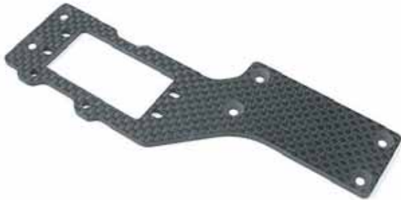
#35 6110 Graphite Radio Plate