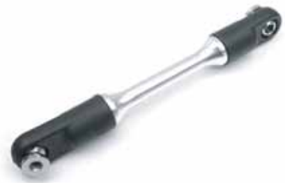
#35 2080 Front Torque Rod Set