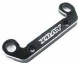
#35 2331 Alu Front Upper Arm Holder - 7075 T6 (5mm)