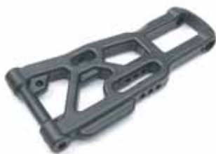
#35 2110 Front Lower Suspension Arm - HARD